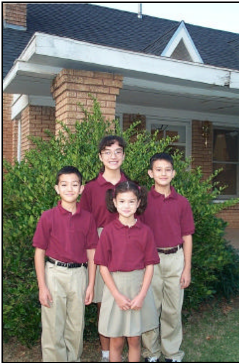
First day of school, 20 August, 2001.