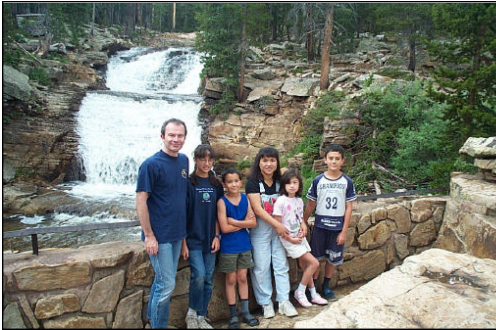
Our family on vacation in Utah, June, 2001.