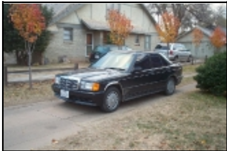
My new car: 1988 Mercedes 190E