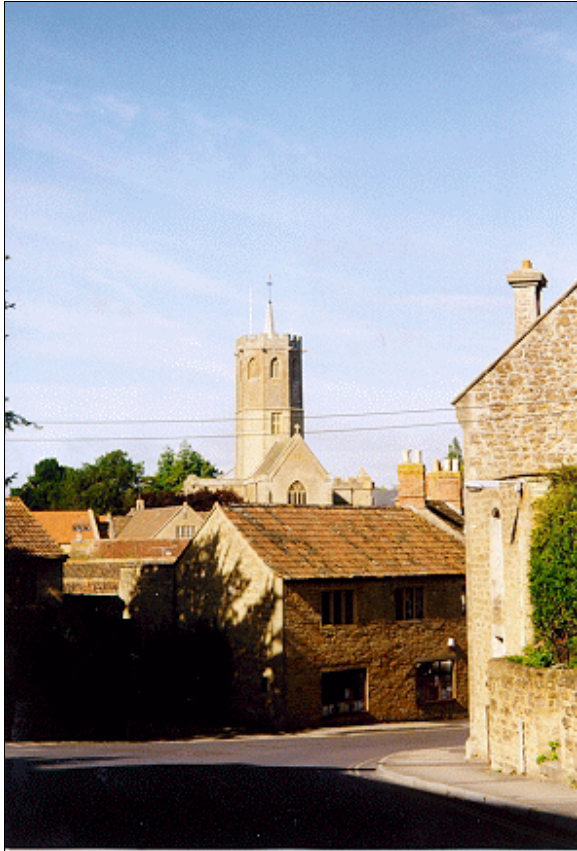
Church of St. Peter and St. Paul in South Petherton, Somerset.

We know about these people from the book, English Origins of New England Families.