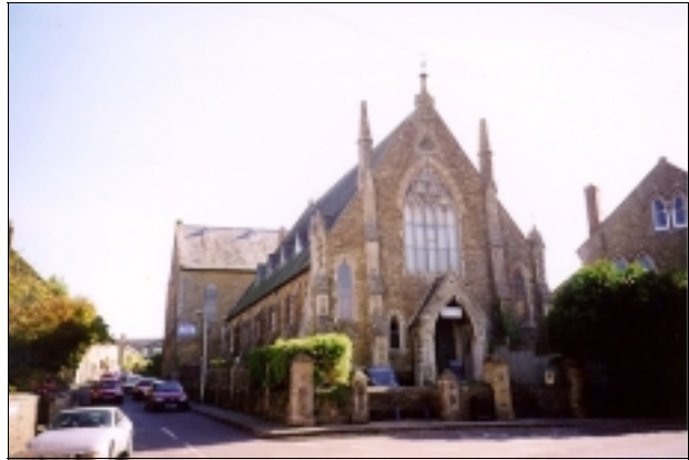
South Petherton, Somerset.